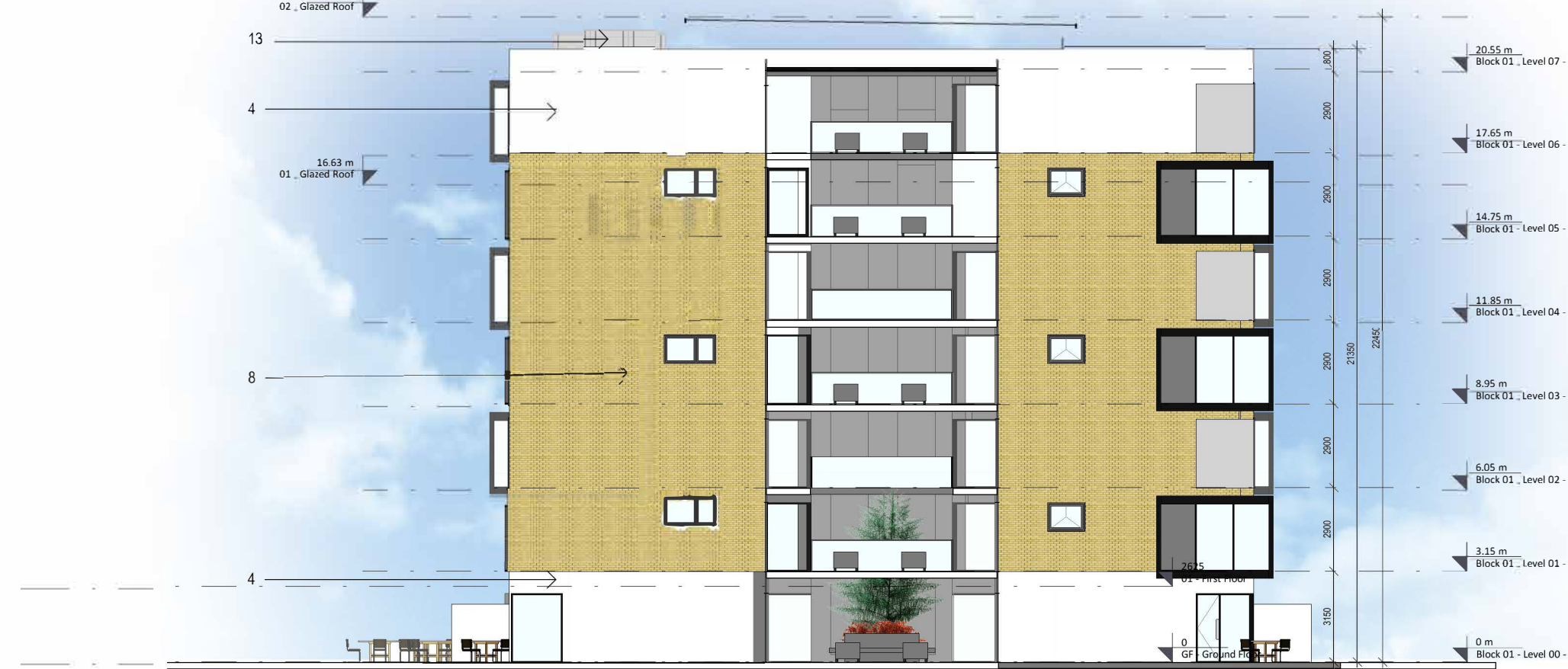
3 Section hh 1:200