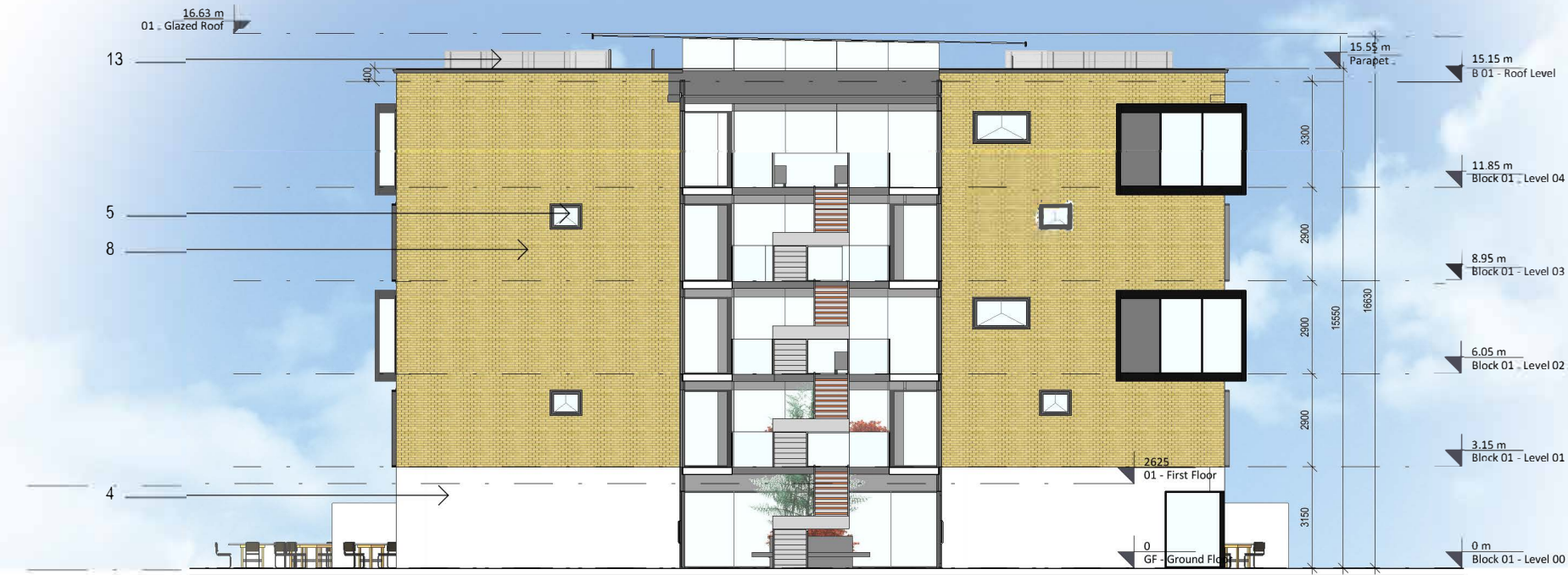
1 Section ff 1:200