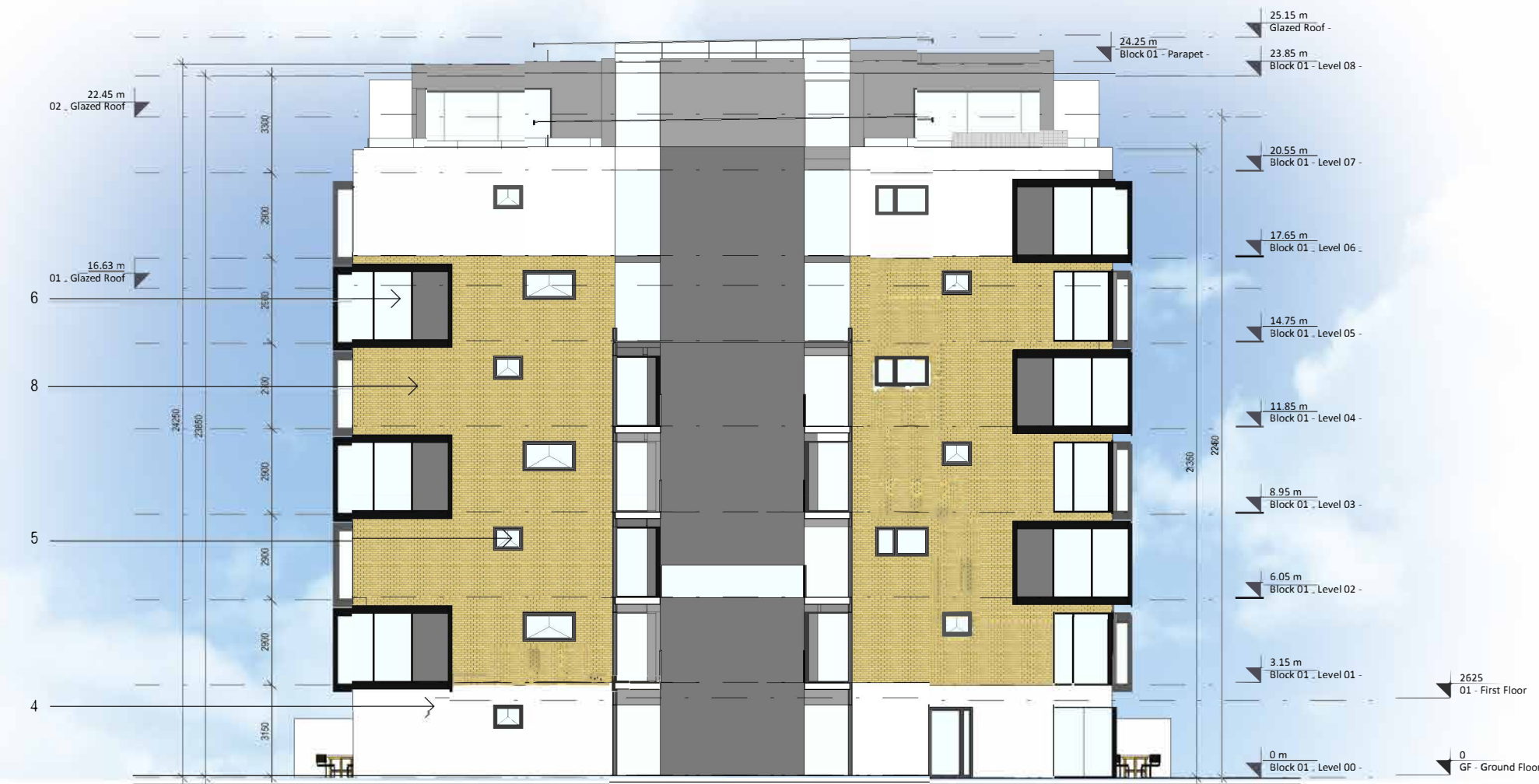
2 Section gg 1:200